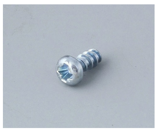
A0304031 Self-tapping screws 0.087" x 0.197" (PZ1)

Subject to technical modification without notice. © by OKW Gehäusesysteme, Buchen/Germany.