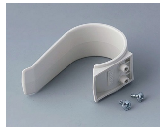
A9167027 Holding clamp PA 6 (UL 94 HB) off-white RAL 9002