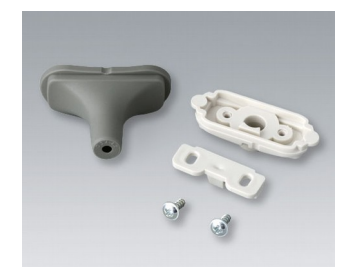
B2911308 Cable gland kit, 0.134" - 0.165" TPE volcano