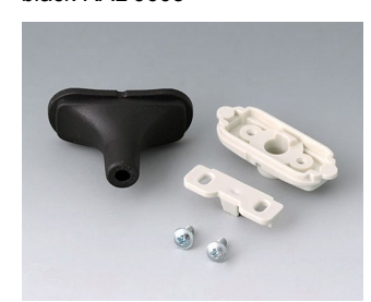
B2911319 Cable gland kit, 0.165" - 0.197" TPE black RAL 9005