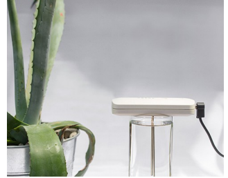
Tool for making colloidal silver solutions