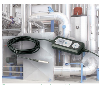
Process monitoring with temperature sensor