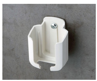
B2921507 Holder S ASA+PC (UL 94 V-0) off-white RAL 9002