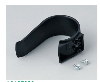
A9167029 Holding clamp PA 6 (UL 94 HB) black RAL 9005