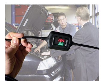
Voltage and current display during trickle charging