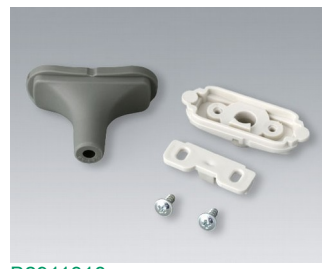
B2911318 Cable gland kit, 0.165" - 0.197" TPE volcano