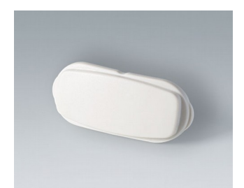
B2811207 End part ASA+PC (UL 94 V-0) off-white RAL 9002