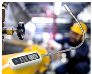
Gas leak detector