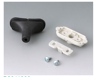
B2911309 Cable gland kit, 0.134" - 0.165" TPE black RAL 9005