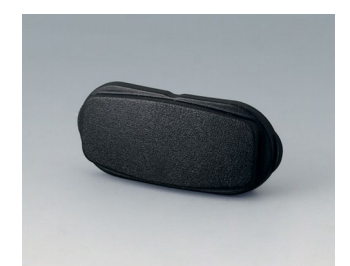
B2811209 End part ASA+PC (UL 94 V-0) black RAL 9005