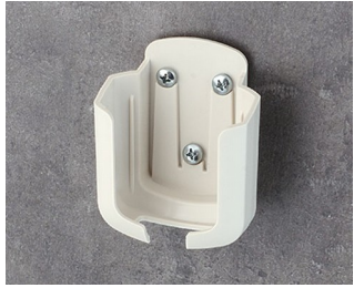
B2931507 Holder M ASA+PC (UL 94 V-0) off-white RAL 9002