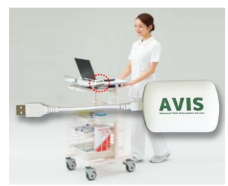
Receiver and data transfer for EMR