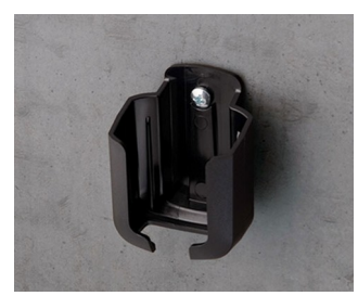
B2921509 Holder S ASA+PC (UL 94 V-0) black RAL 9005