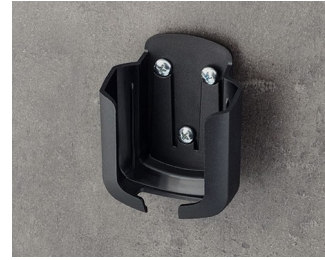
B2931509 Holder M ASA+PC (UL 94 V-0) black RAL 9005