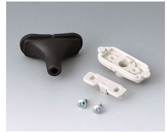
B2911329 Cable gland kit, 0.197" - 0.232" TPE black RAL 9005