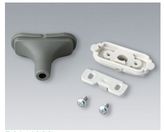
B2911328 Cable gland kit, 0.197" - 0.232" TPE volcano