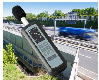
Noise level measurement