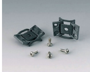
C8100360 Internal hinge set