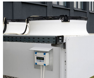
Heating/air conditioning/ventilation control