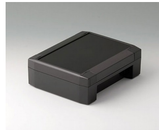
C8014181 SOLID-BOX 145 PC+ABS (UL 94 V-0) anthracite gray RAL 7016 7.09"x5.71"x2.36" IP 66, IP 67, IK 08