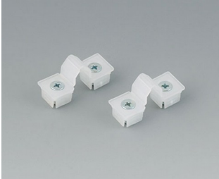
C2299031 Securing hinge for the cover PP natural-colored