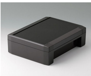
C8017221 SOLID-BOX 175 PC+ABS (UL 94 V-0) anthracite gray RAL 7016 8.86"x6.89"x2.76" IP 66, IP 67, IK 08