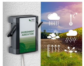
Weather station in agriculture